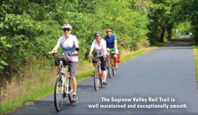
The Saginaw Valley Rail Trail is well maintained and exceptionally smooth.